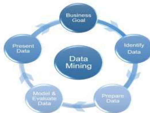
Figure 1: Data Mining [3]

These organization sectors include retail, petroleum, telecommunications, utilities, manufacturing, transportation, credit cards, insurance, banking, decision support, financial forecast, marketing policies, even medical diagnosis and many other applications, extracting the valuable data, it necessaryto explore the databases completely and efficiently.